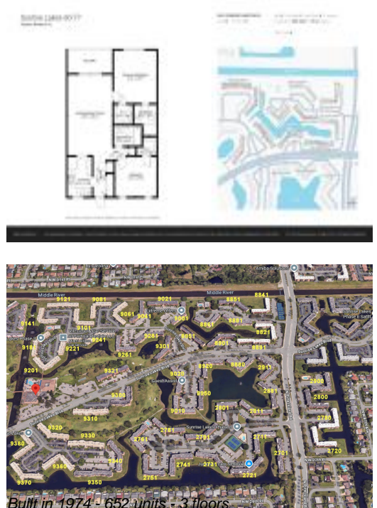
Built in 1974 - 652 units - 3 floors