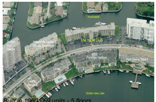
Built in 1960 - 69 units - 5 floors