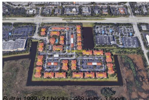
Built in 1999 - 21 blocks ~468 units - 3 floors