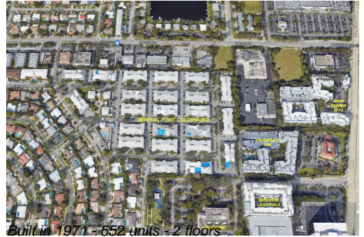
Built in 1971 - 552 units - 2 floors