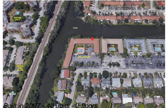
Built in 2007 - 40 units - 2 floors