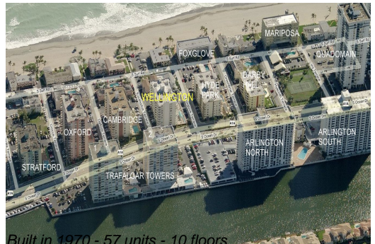
Built in 1970 - 57 units - 10 floors