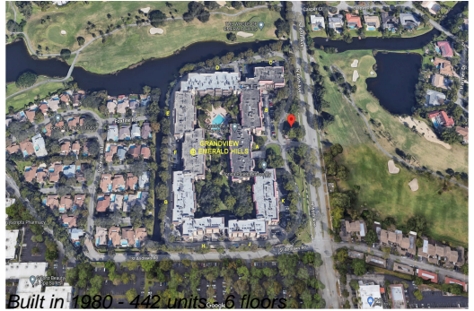
Built in 1980 - 442 units, 6 floors