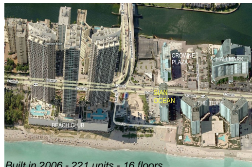
Built in 2006 - 221 units - 16 floors