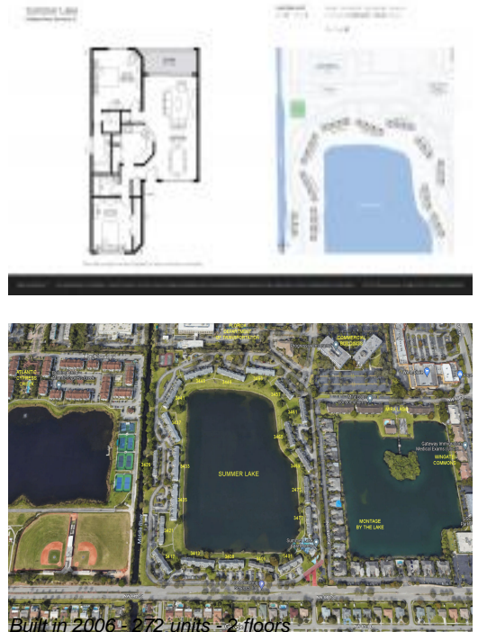
Built in 2006 - 272 units - 2 floors