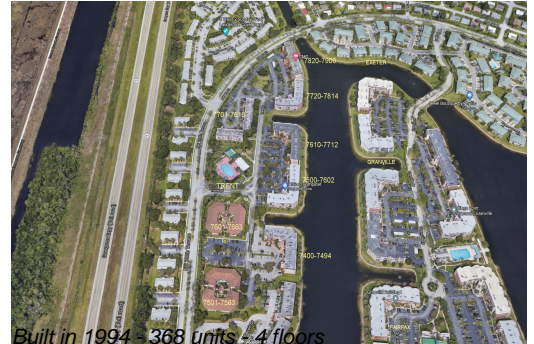
Built in 1994 - 368 units - 4 floors