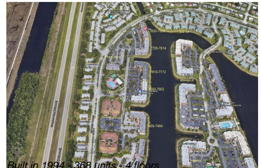
Built in 1994 - 368 units - 4 floors