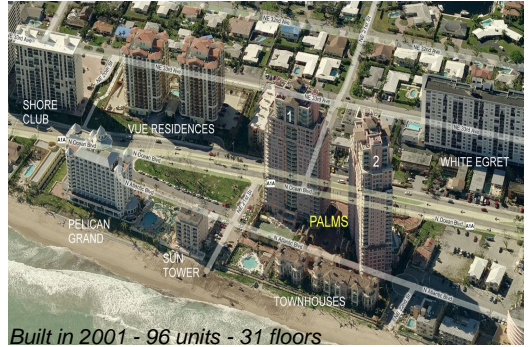
Built in 2001 - 96 units - 31 floors