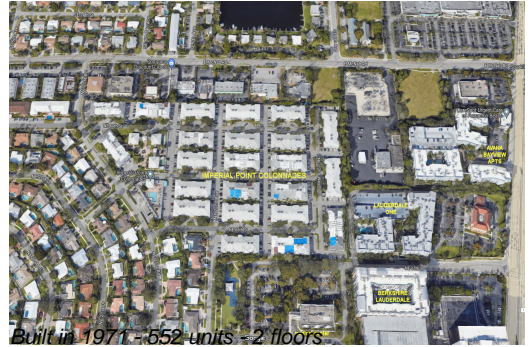
Built in 1971 - 552 units - 2 floors.