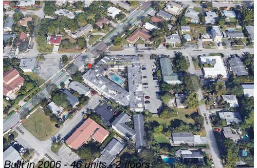
Built in 2006 - 46 units - 2 floors