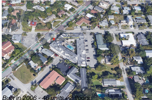
Built in 2006 - 46 units - 2 floors