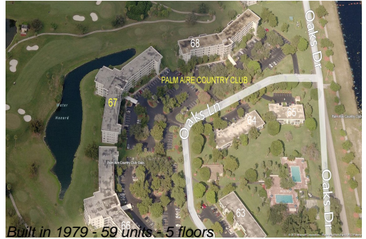
Built in 1979 - 59 units - 5 floors