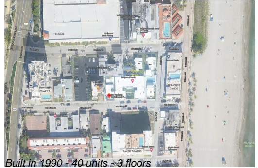
Built in 1990 - 40 units - 3 floors