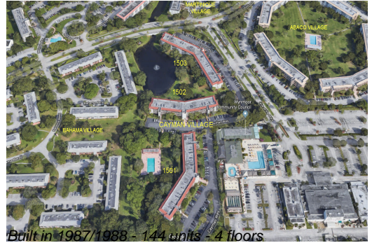
Built in 1987/1988 - 144 units - 4 floors