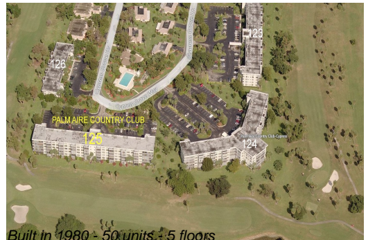
Built in 1980 - 50 units - 5 floors