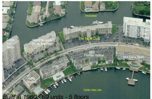
Built in 1960 - 69 units - 5 floors