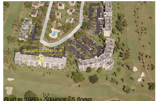
Built in 1980 - 50 units - 5 floors