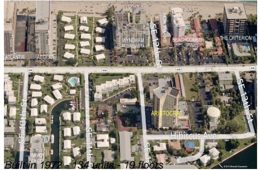
Built in 1972 - 134 units - 19 floors