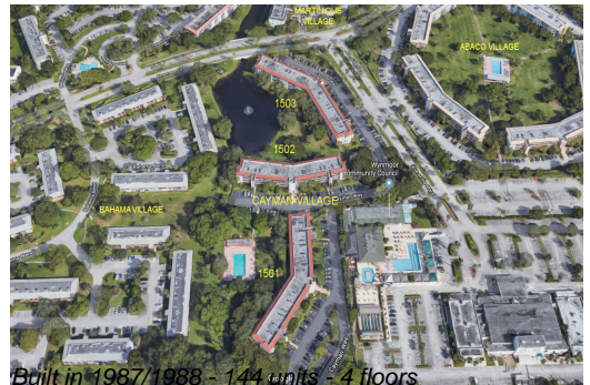
Built in 1987/1988 - 144 units - 4 floors