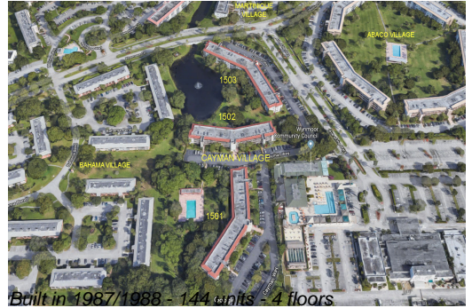
Built in 1987/1988 - 144 units - 4 floors

The above valuated price is a baseline figure that does not take into account any specific renovation, upgrade, split, merge, or deterioration of the unit.