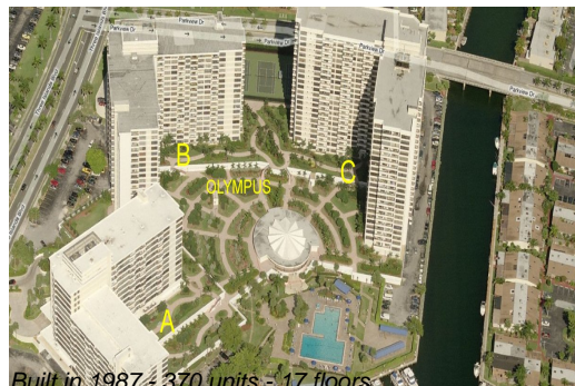
Built in 1987 - 370 units - 17 floors