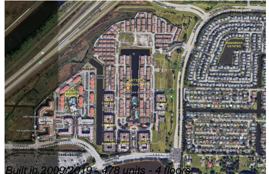
Built in 2009, 2019 - 478 units - 4 floors