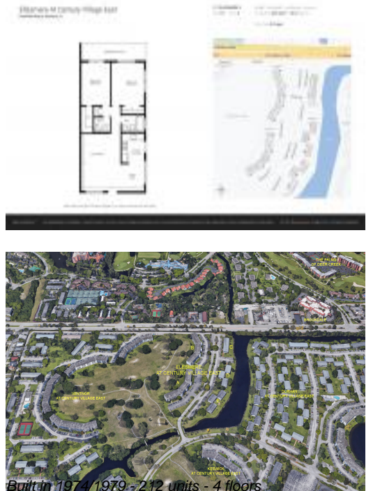
Built in 1974/1979 - 212 units - 4 floors