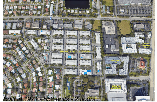
Built in 1977 - 552 units - 2 floors