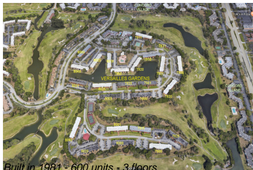
Built in 1981 - 600 units - 3 floors