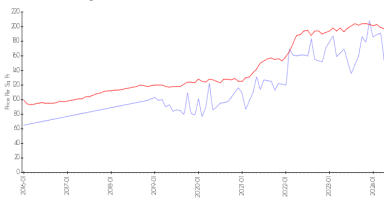
Lucaya Village (A to D - 1 & 2) vs Coconut Creek