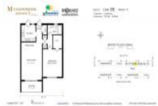
Built in 1973 - 56 units - 7 floors

205 - 1001 NE 14 Av, Hallandale Beach, FL, Broward 33009