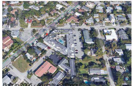
Built in 2006 - 46 units - 2 floors