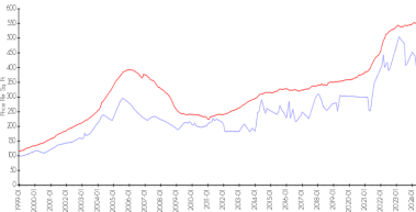
Galleon vs Fort Lauderdale