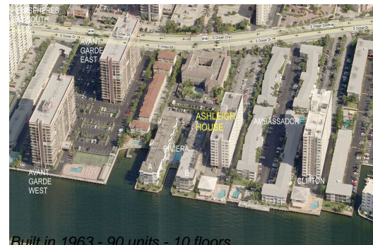
Built in 1963 - 90 units - 10 floors