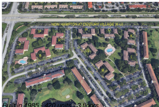
Built in 1985 - 420 units - 9 floors