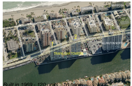
Built in 1969 - 120 units - 16 floors