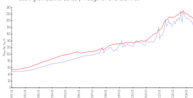
Buckingham East at Century Village vs Pembroke Pines