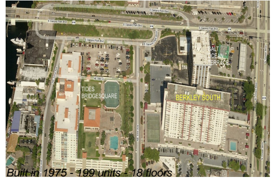
Built in 1975 - 199 units - 18 floors