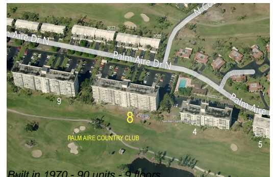
Built in 1970 - 90 units - 9 floors