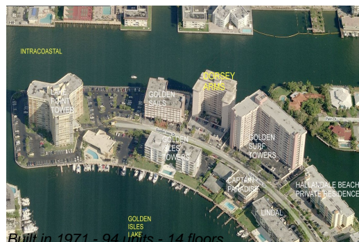
Built in 1971 - 94 units - 14 floors