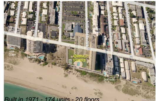
Built in 1971 - 174 units - 20 floors