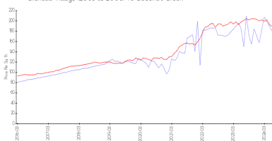
Granada Village (2001 to 2006) vs Coconut Creek