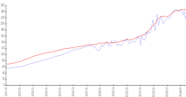
Savannah at Riverside vs Coral Springs