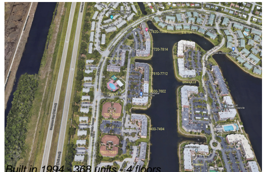
Built in 1994 - 368 units - 4 floors