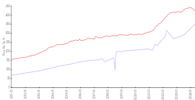
Lakewood at Emerald Hills vs Hollywood Beach