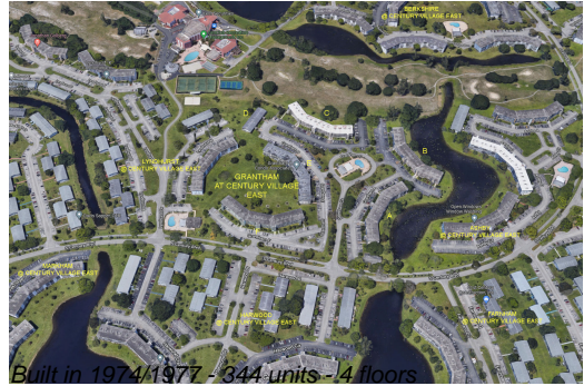
Built in 1974/1977 - 344 units - 4 floors