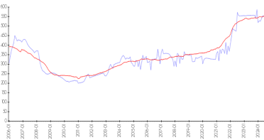
Symphony North vs Fort Lauderdale