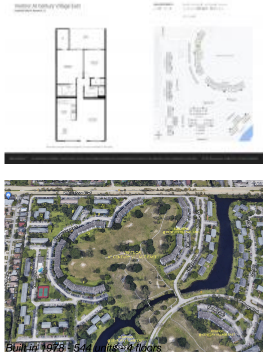
Built in 1978 - 544 units 3 floors