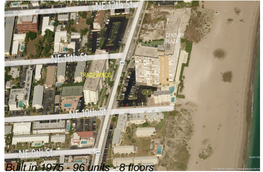
Built in 1975 - 96 units - 8 floors