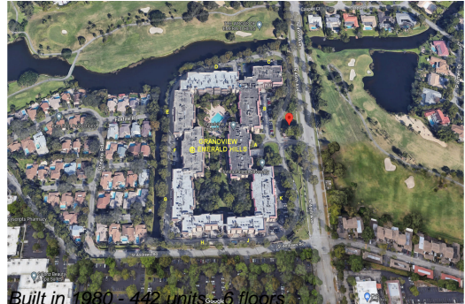
Built in 1980 - 442 units, 6 floors