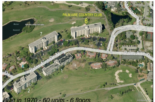
Built in 1970 - 60 units - 6 floors