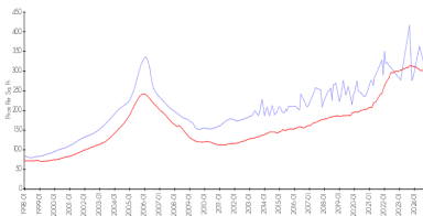
Atlantis vs Pompano Beach